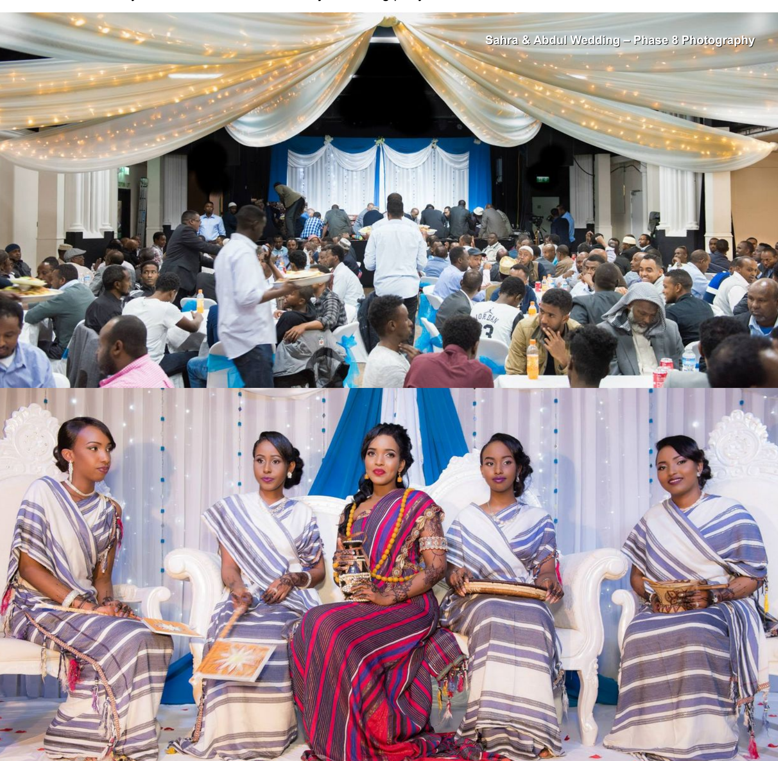
Trinity Community Arts Ltd Registered Charity number 1144770 Registered Company Number 4372577

The rich programme of events that is booked here is tailored with our local area in mind, enabling people that wouldn't otherwise have access to a space this size create events for the people in their community be it educational, creative or just one big party!